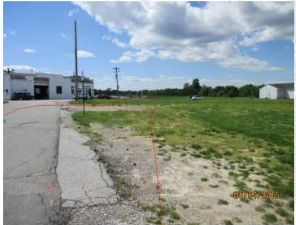
Looking West Along Proposed Alignment