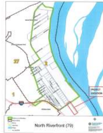
SUBSET A-1: Illustrative Map For Application 1802903 - City of St. Louis Hall Street Reconstruction - Phase 1 Page 5