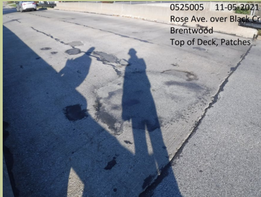
0525005 11-05-2021 Rose Ave. over Black Cr. Brentwood Top of Deck, Patches