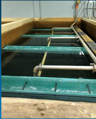
Fiberglass filter troughs