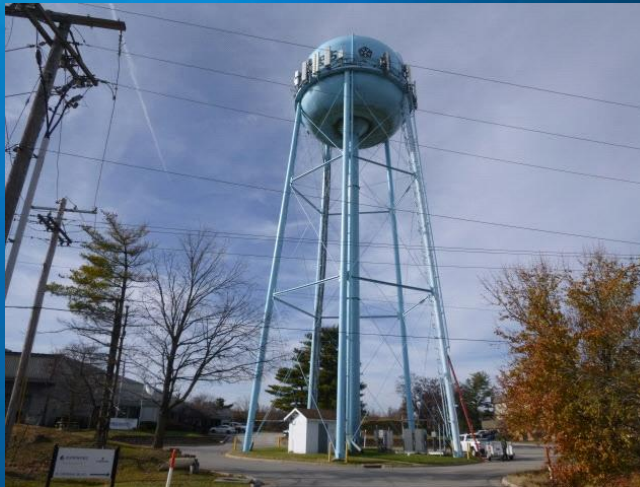
Arrowhead Tank Painting